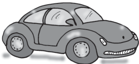
This car is new

Sometimes adjectives may have the opposite meaning. Opposites are words whose meanings are as different as possible from each other.