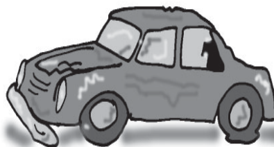
That car is old

Join up the adjectives that are opposite in meaning.